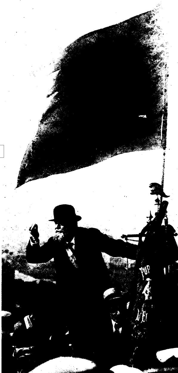
Figure 2. Jean Jaures, paragon of leftist intellectual activism, from an article by Andre Glucksmann on the psychology of pacifism.

This parity evaporated, however, in the war. On the one hand, French conservatism stood discredited not only by its xenophobic nationalism, its antiegalitarianism, and its flirtation with fascism in the prewar years, but also by the participation of many of its leading exponents in the collaborationist Vichy regime. On the other hand, the left (except for the PCF in the brief era of the Nazi-Soviet Pact) had stood squarely against fascism and the occupation. It formed the backbone and largest block of fighters in the Resistance, and among these the Communists played a commanding (if often self-serving) role. The