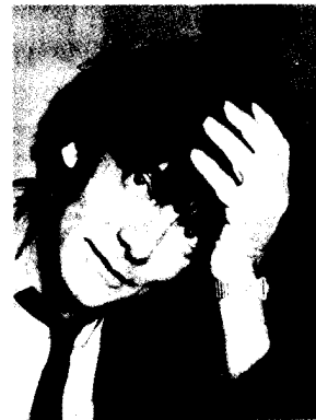
Figure 6. Andre Glucksmann [redacted]