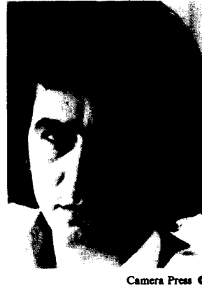
Figure 5. Bernard-Henri Levy [redacted]