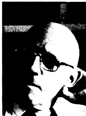
Figure 1. Michel Foucault