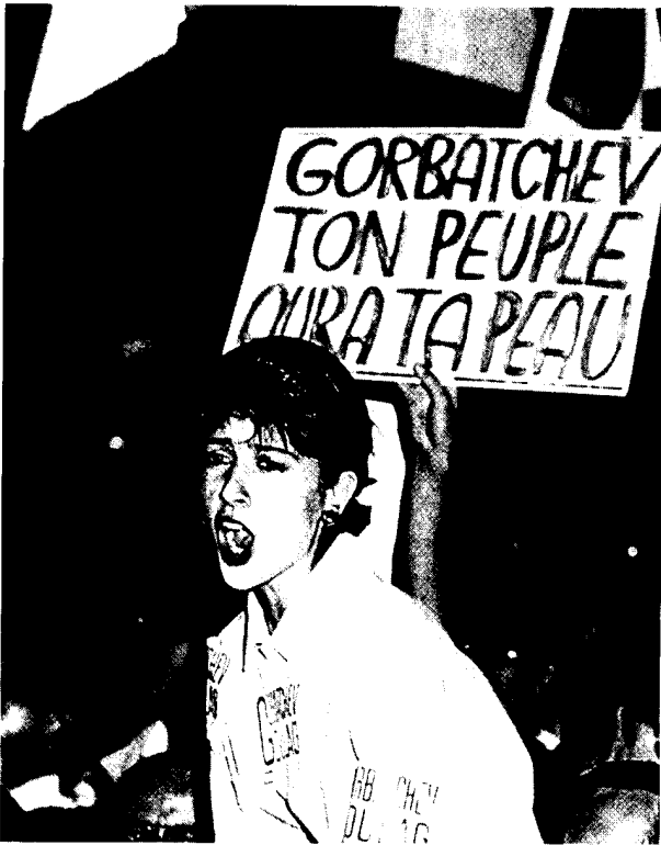
Figure 7. Students protest Gorbachev's visit to France in October 1985.

less government and more self-sufficiency—has only weak support in both intellectual and public opinion, judging from recent polls and media reports.