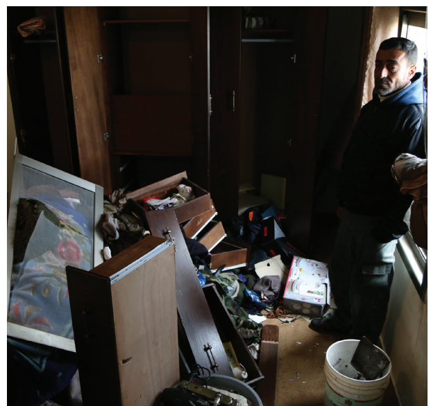
Soldiers invade the Tamimi family home in the village of Nabi Salah, August 23, 2020.

The secondary importance the military ascribes to protecting Palestinians' rights when intruding into their homes is reflected in the absence of binding, publicly accessible directives on protecting these rights, such as directives intended to prevent arbitrary damage to property. It is also reflected in soldiers and officers' lack of familiarity with directives concerning the protection of minors when their homes are invaded or when they are arrested. Without such directives, the extent to which the rights of household members are violated varies according to the personality and whim of the commander on the ground.