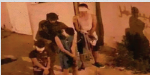
Soldiers arresting children and adults from Deir Nidham during a large-scale arrest operation, and posting flyers in the village, August 1, 2019.

At about 4 A.M. I left to pray. I didn't see any soldiers on my way to the mosque. There were about 15 people in the mosque. We prayed until nearly 5 A.M. When we left the mosque there were about 20 soldiers standing outside the entrance. The soldiers didn't talk to us and we didn't speak to them. We went home. I saw about ten more soldiers walking towards the village's eastern neighborhood. When I had almost reached our house, I saw my son leaving the gate with two soldiers. He wasn't handcuffed and he didn't look threatened. He pointed to me and said, "Here's my father". One of the soldiers came up to me and demanded I give him my ID card. I said it was at home and asked if he wanted me to go get it. He let it go and kept walking.