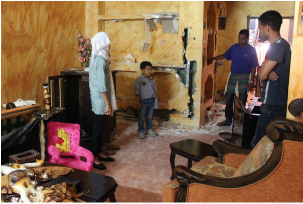
Soldiers invade the Tamimi family home in the village of Nabi Salah, August 23, 2020.

Similar use of home invasions as a deterrent is made in search and arrest raids conducted in response to stone-throwing or attacks and attempted attacks on Israeli soldiers or civilians. Invading homes without concrete suspicions against any of the occupants is an element of military action designed to deter and sow fear in the community, and in some cases, collectively punish an entire community for the actions of individuals.