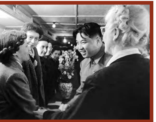
Kim Il-sung greets members of the Women's International Democratic Federation in 1951.

Patriots, Traitors and Empires recounts modern Korean history from the point of view of those who fought to free Korea from the domination of foreign empires. First Japan, then the United States.