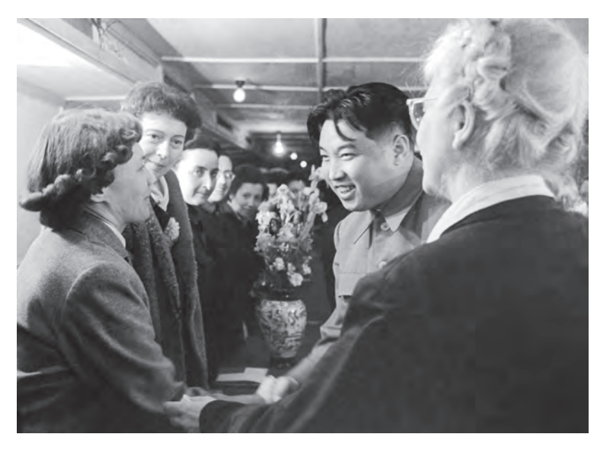
Kim Il-sung greets members of the Women's International Democratic Federation in 1951. (Photo: Alamy Stock).

Communist Party-led Northeast Anti-Japanese United Army. Under his command were several Chinese regimental commanders.<sup>10</sup>