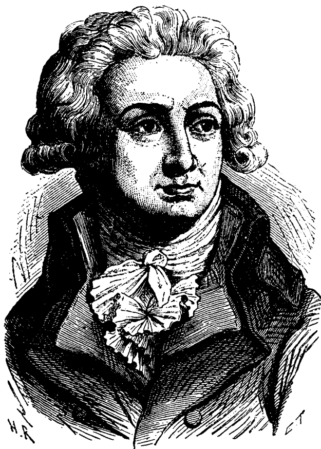
HÉRAULT DE SÉCHELLES