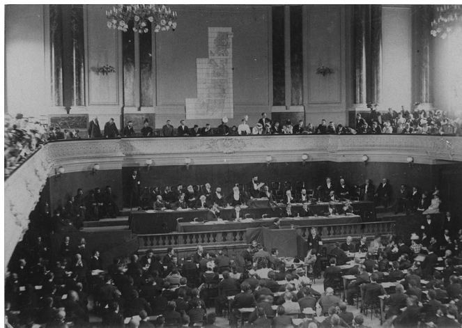
Theodor Herzl and the creation of the Zionist movement, 1897-1917

2. The Second Zionist Congress was held in Basel in August 1898. Herzl insisted that all delegates wear formal attire—much to the chagrin of the Russian delegates.