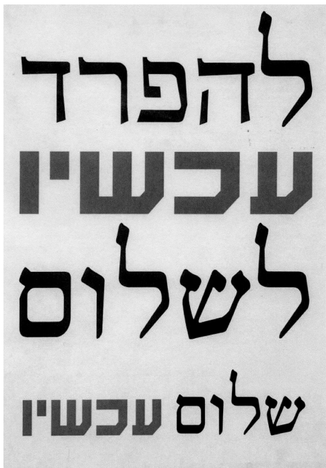
7. Founded in 1978, Peace Now (Shalom Akhshav) was one of the largest antiwar and anti-Occupation movements in Israel. This poster reads “To separate now for peace. Peace Now,” urging the Israeli government to withdraw from the occupied territories in order to achieve peace between the Israelis and the Palestinians.