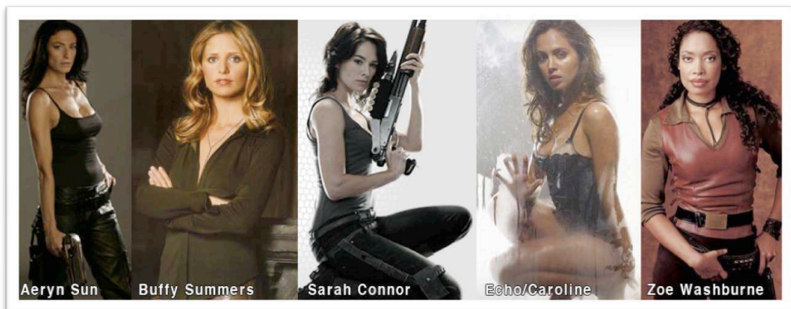
Figure 1: Warrior Characters

including being called to adventure, refusing the call, having supernatural aids and receiving a boon that assists in finally completing the goal. In contemporary films and television, writers still rely on the heroic journey Campbell documents. The warrior is identified by his/her physical strength and use of brawn to solve conflicts and like the traditional hero s/he is fighting for a noble and selfless cause.