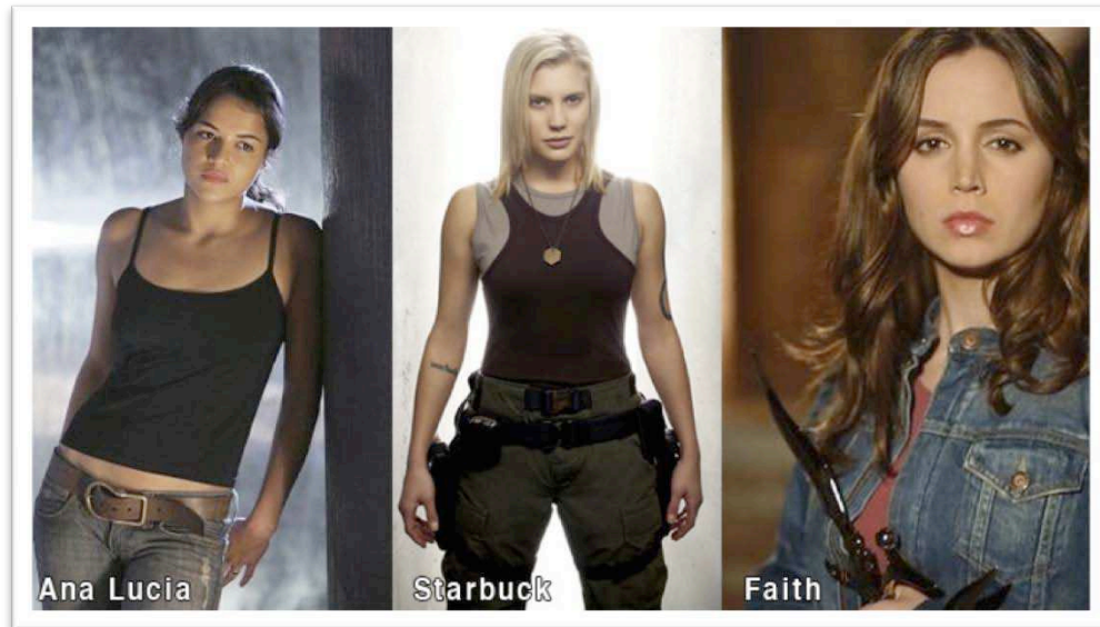
Figure 4: Anti-Hero Characters

examine three characters: Kara Thrace, Faith and Ana Lucia, specifically focusing on how they reaffirm or diverge from traditional masculine values through the anti-hero archetype.