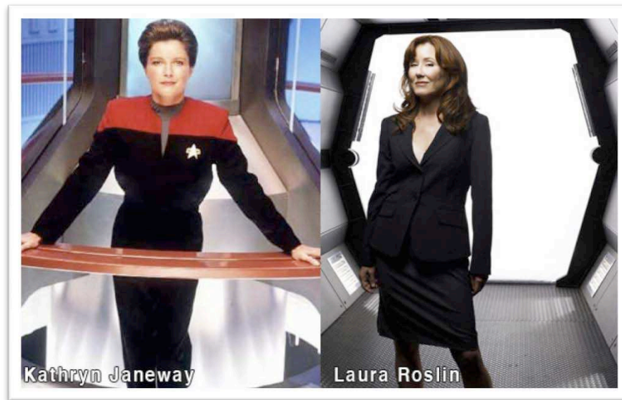
Figure 3: Leader Characters