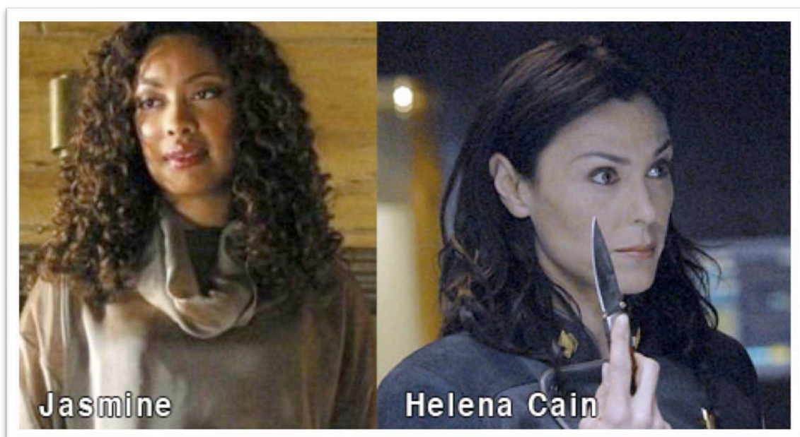
Figure 5: Villain Characters

Historic villains are notable for their mustache twirling, cackling laugh and generally suspicious demeanor. Contemporary villains are not always as cartoonlike but are identified quickly as the adversary and foil to the hero of the story. Often they are characterized as complete opposites to the heroes. Just as the strong female hero will be sexualized through revealing clothing, the female villain will often be framed as even more sexually suggestive and subversive.