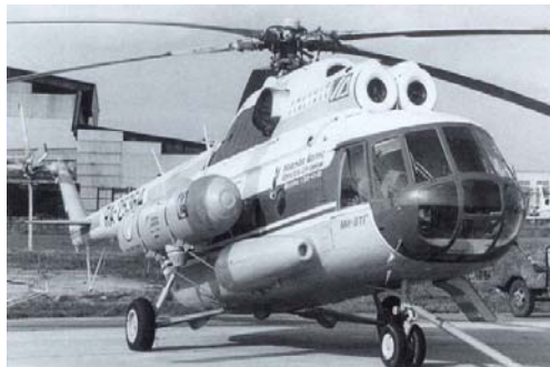
Figure 5 Mi-8TG with external ACKT pods [25].

In the 1980's leading Russian aviation companies, petroleum industries and universities collectively proposed a new fuel as an alternative to Avtur. This new fuel called ACKT was a mixture of hydrocarbons with LC_4H_{10} as the dominant component. It was claimed that ACKT had superior qualities compared to Avtur [3, 23]. For example, it was significantly cheaper, non-toxic and less aggressive to sealants. The use of the ACKT was also estimated to reduce fuel costs by a factor of 3-8. In order to demonstrate the feasibility of the concept and explore its benefits, the Mil Helicopter organization conducted a development program [24], which resulted in the production of the Mi-8TG prototype using ACKT (carried in external pod tanks produced from automotive LPG tanks), see Figure 5.