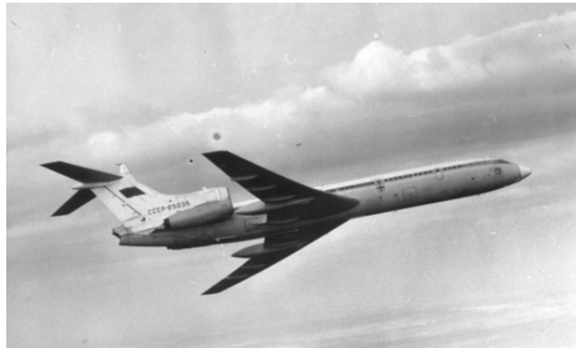
Fig. 2 Tupolev 155 LNG fuelled aircraft during test flight 18 Jan. 1989 [2].

However, LNG or LPG aircraft may become highly-attractive as an interim option in order to mitigate predicted escalations in Avtur costs, as well as partly meeting targets for greenhouse gas emissions set for 2020. Of course such a radical replacement would require extensive changes to airport infrastructure as well as significant modifications in aircraft design and engine technology. Despite this infrastructure barrier, renewed Russian activity [3] with LNG-LPG aircraft is worth noting. Furthermore, Boeing [4] has recently indicated in the NASA-led “Subsonic Ultra Green Aircraft Research (SUGAR)” programme that LNG could be a viable future alternative. Greitzer and Salter (2010) also advocated the possible use of LNG for “N+3” aircraft [5].