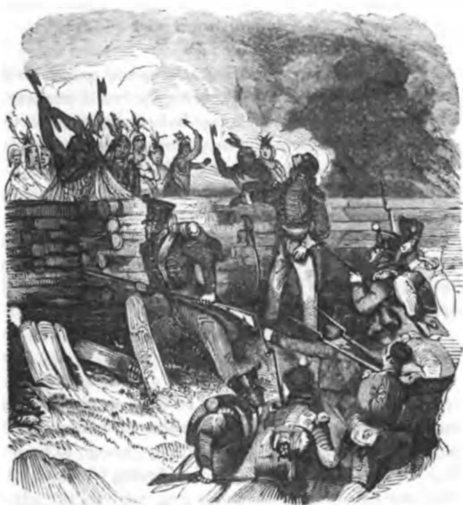
Battle of Tohopeka

As a movement to return to the traditional ways of living, the Creeks had to follow their traditions that demanded the violent deaths of their enemies. While they quickly succumbed to prag-