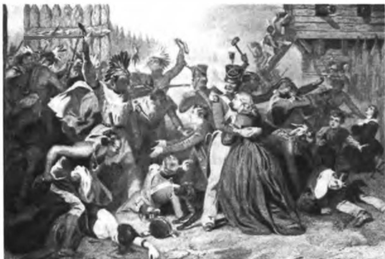
Massacre at Fort Mims