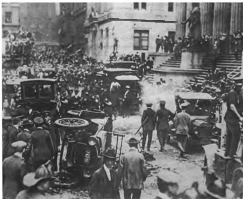
Wall Street bombing, 1929