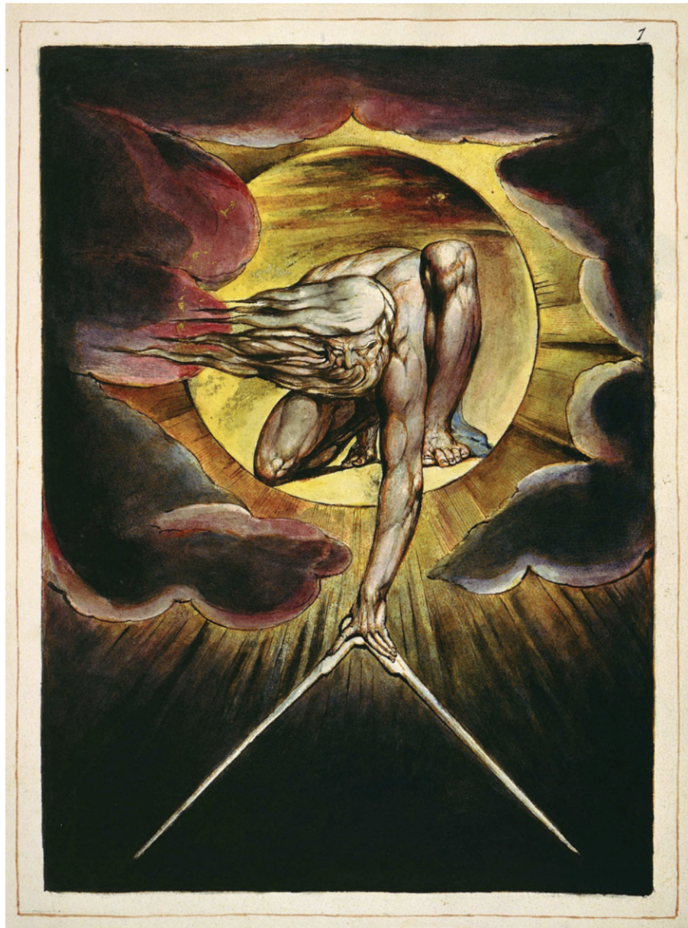
Fig 2. The compass is associated with power (in a geometrically gendered arrangement) by William Blake in Europe: A Prophecy (1794) — ‘When he sets a compass upon the face of the deep’ (Proverbs 8: 27) [Public domain], via Wikimedia Commons, https://commons.wikimedia.org/wiki/File:Europe_a_Prophecy_copy_K_plate_01.jpg