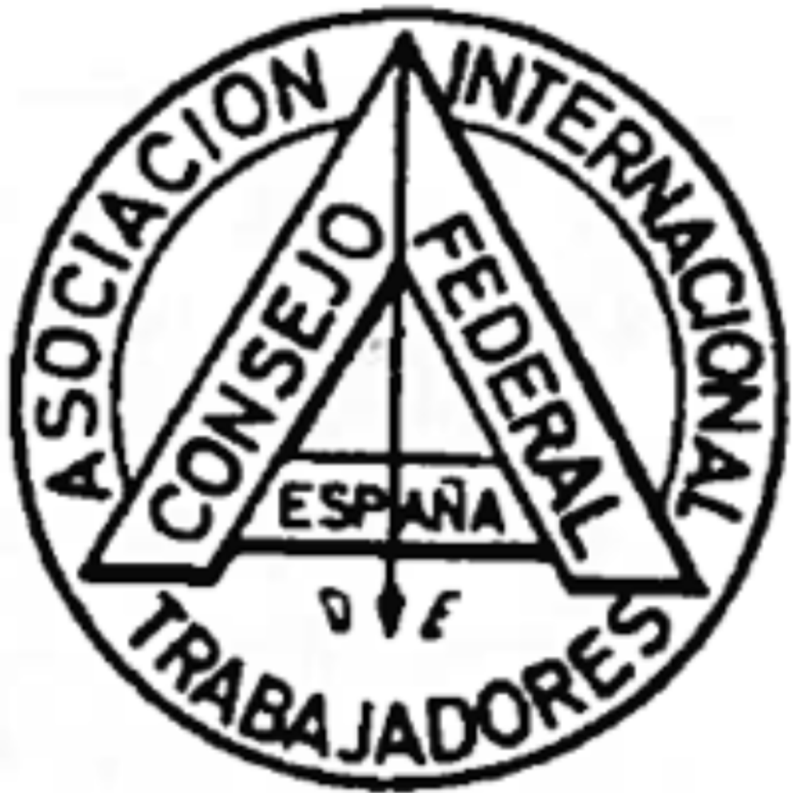
Fig 3. The seal of the Consejo Federal de España de la A.I.T. , circa 1870, by Vilallonga (own work, based on AIT.jpg) [CC BY-SA 2.5 ( https://creativecommons.org/licenses/by-sa/2.5 )], via Wikimedia Commons, https://commons.wikimedia.org/wiki/File:FRE-AIT.svg