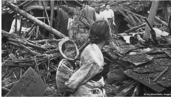
Pyongyang, North Korea, in the aftermath of an air raid by U.S. planes in fall 1950. A total of 420,000 bombs eventually would be dropped on a city that then boasted approximately 400,000 residents.

As Césaire would trenchantly comment in Discours sur le colonialisme (1955), “capitalist society...is incapable of establishing a concept of the rights of all men”—and further noted that it degrades humans by subjecting them to “thingification.” 49 Césaire’s critique begins to alert us to a “major deficiency in the doctrinal analysis of international law,” namely, “that no systematic undertaking is...offered of the influence of colonialism in the development of the basic conceptual framework of the subject.” 50 Indeed, the very “edifice of international law embed[s] relations of imperialist domination.” 51 It is thus no coincidence that the various human rights vernaculars—anticolonial, race radical, communitarian, Third World—that flashed up during the Cold War with visions of “a humanism made to the measure of the world,” have today been relegated to the status of “rebellious specters” in the dominant paradigm of international human rights. 52 That the liberal model of rights has prevailed in this era of advanced global capitalism “as the privileged ideological frame through which excessive cruelty [is] conceived and interpreted” has meant the neutralization, as Randall Williams has argued, of “other epistemic forms and political practices.” 53 On the institutional