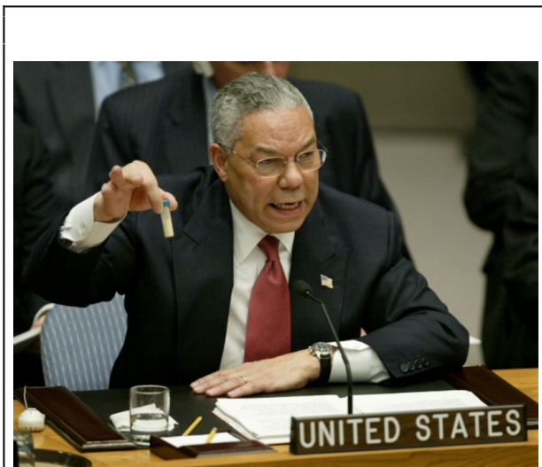
Colin Powell, at the United Nations on February 5, 2003, making the case for U.S. war in Iraq