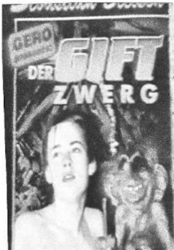
The Poison Dwarf