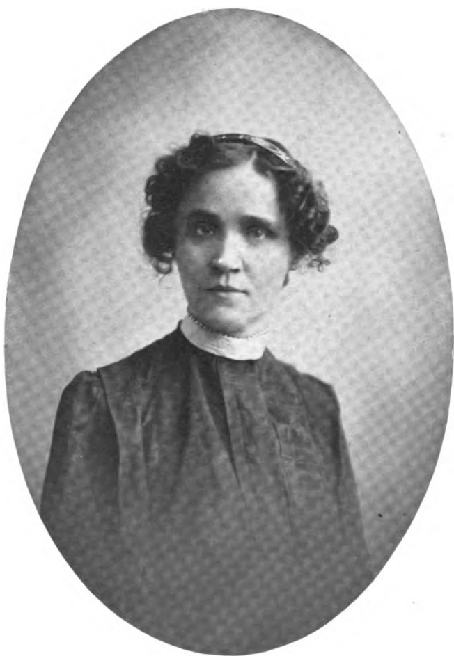
Voltairine de Cleyre.