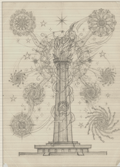
THE DMN UNRAVELING — NEURAL LIBERATION

By temporarily quieting the DMN, psychedelics allow different parts of the brain to talk to each other, breaking down rigid patterns of thought. It allows you to perceive directly that the walls between "you" and "the other" are socially constructed — a material lie upheld by a dying system.