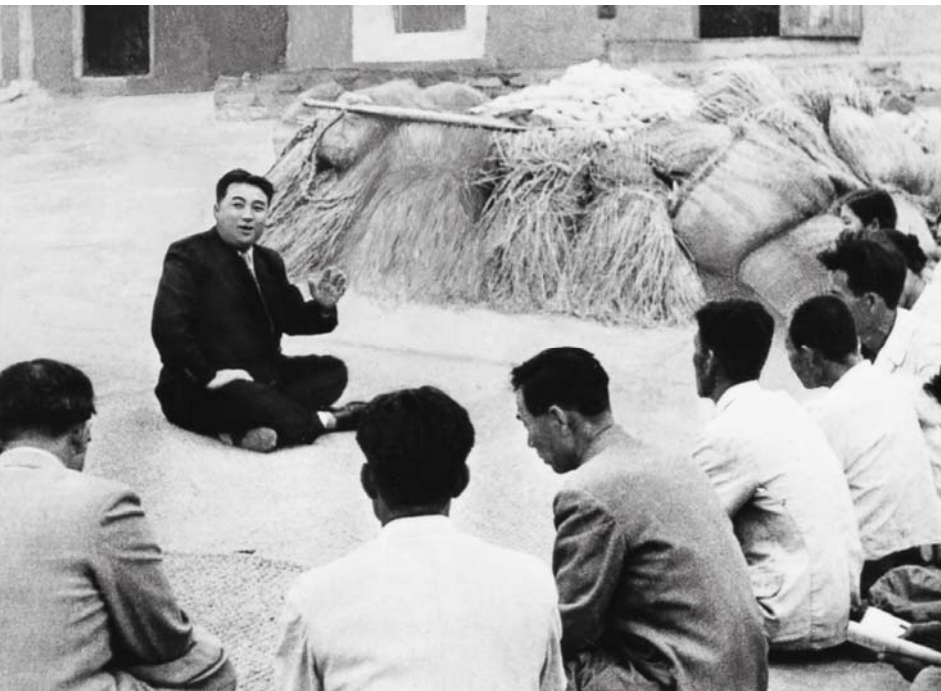
Kim Il Sung talking with the farmers at Chongsan-ri, Kangso County (October 1958)