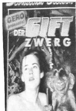
The Poison Dwarf, Gero-Video