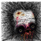
Cover: "Untitled" by Unknown Artist (published online circa 2020).

Part punk manifesto, part modernist love story, this book is a must-read for anyone who's ever stared into the black mirror of their phone screen and wondered what it means to be human in an age of ones and zeros.